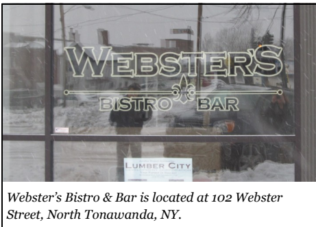
Webster's Bistro & Bar is located at 102 Webster Street, North Tonawanda, NY.